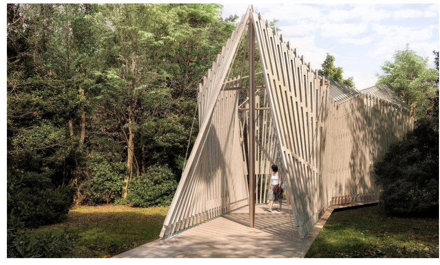
The Vatican City pavilion by Norman Foster at the Venice Biennale

In the Venice Architecture Biennale they may have an unlikely ally. The event is hardly going to ease the city's pedestrian traffic; opening on May 26, it is expected to draw 300,000 visitors to Venice over a six-month period. Yet the world's premier architectural showcase — this year featuring 65 national participations and a busy schedule of additional offerings, including an exhibition from the V&A on the Robin Hood Gardens estate in east London — is a teeming marketplace of ideas. This, surely, is no bad place to start searching for solutions to the Venetian problem.