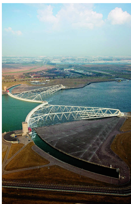
How the Dutch hold back the sea

The biggest extra effect of human activi-